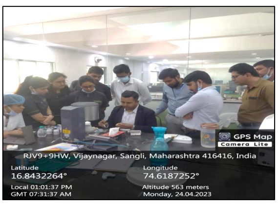
Metric No-3.3.2 Bharati Vidyapeeth (Deemed to be University) Dental College & Hospital, Sangli