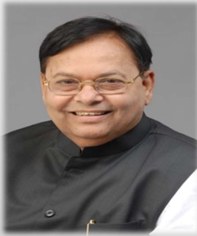
Hon'ble Dr. Patangrao Kadam Saheb

Social Transformation Through Dynamic Education